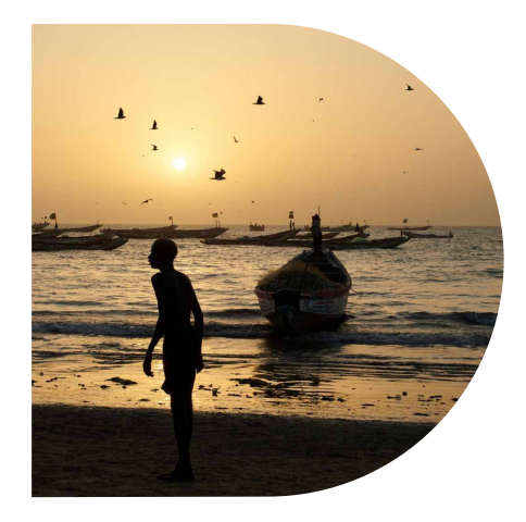
contribute to a positive world change