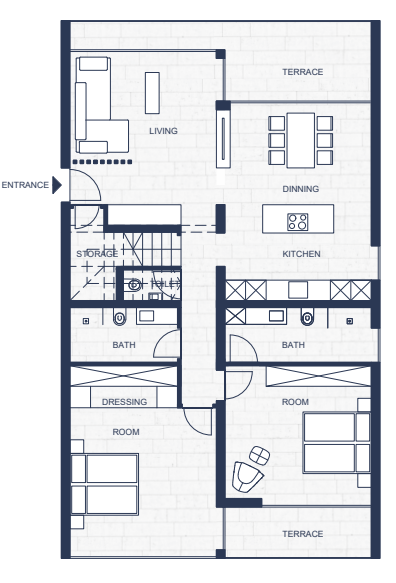
Variant 1 - undivided floor plan

A clearly structured floor plan forms the basis for a balanced living environment and can do much to create a feeling of harmony with oneself. When you enter the apartment, you immediately feel the well thought-out line of the room structure. First, an open, generously proportioned kitchen and living area opens up with a terrace in front, which additionally extends the enclosed living area into the outdoors. The floor-to-ceiling windows make the boundary between inside and outside almost disappear. The individual rooms and bathrooms are located in the rear part of the flat. Ingeniously planned, the two rooms in the back can be used as a separate apartment. Towards the green zone, there is also a terrace as an extension of the usable space, but in contrast to the other side, it represents an absolutely private retreat. Sometimes one just needs peace and quiet, so spaces must be created that have a calming effect, but on the other hand, sometimes stimulation and energy are needed to get back into a state of well-being. It is important to create an appropriate balance of individual requirements in the design. The energy invested in the design and harmonisation of the living space, positively affects the overall attitude towards life.