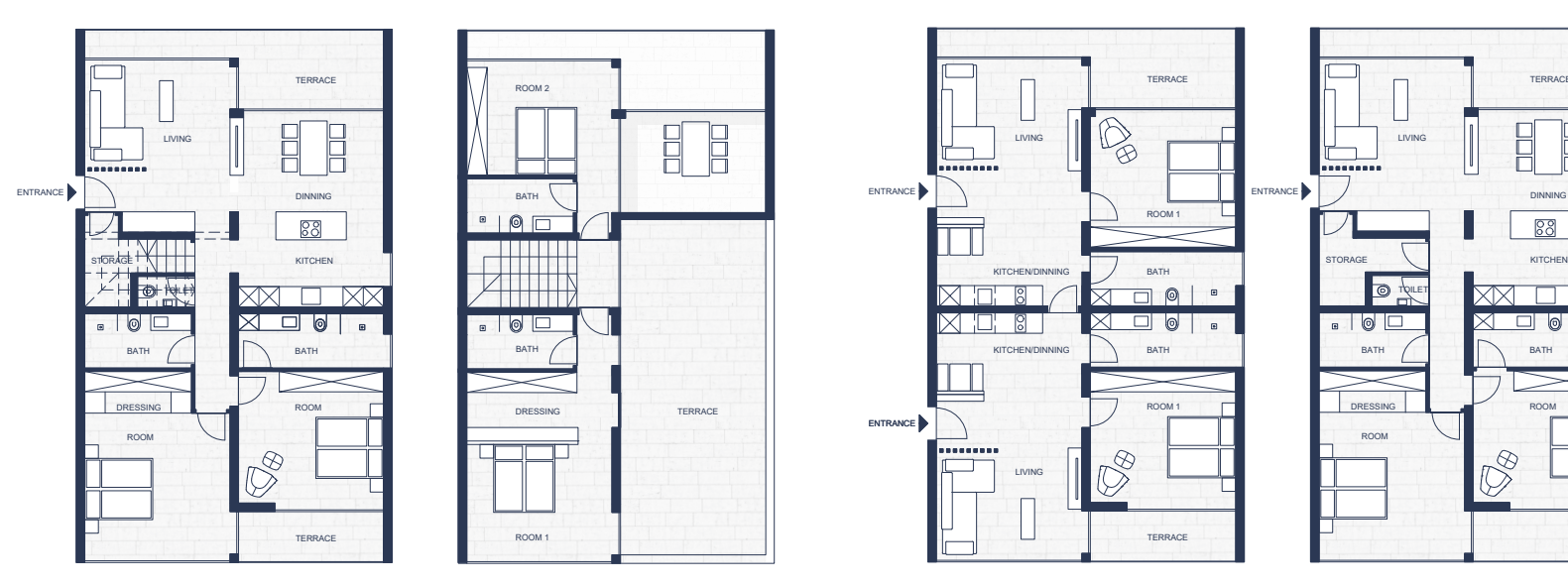
Variant 1 – undivided floor plan