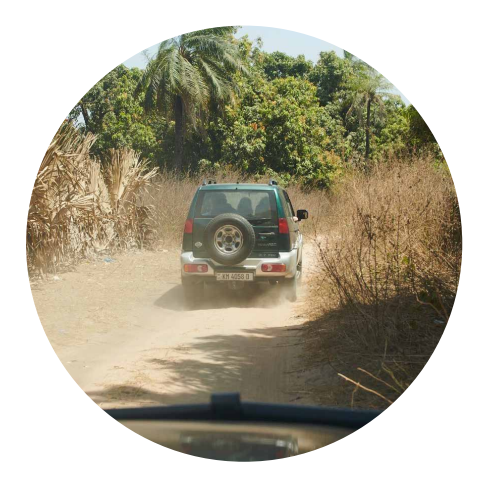
live financial and entrepreneurial freedom and independence