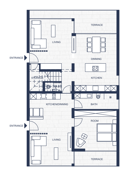
Variant 2 - split floor plan